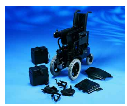
Disassembled for transport.